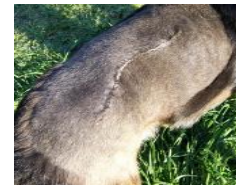
Eddie full of staples.