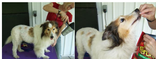
Maisey gets blown dry after her shampoo and cut. Maisey was voted “most tolerant” by Hallie Hill staff.

afterward be given a hair and nail trim to make them more comfortable in the hot days of summer. The Hallie Hill staff is not yet professionally trained in grooming. However, the dogs do not seem to mind the creative cuts they receive, as long as many treats are given during the grooming process.