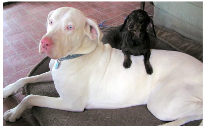
Stella weighs in at 100 pounds and Maggie is one of our smallest at 9 pounds.

different fur colorings and coat patterns among the cats: tabby, tortoiseshell, calico, bicolor, and mackerel are all represented in our cattery.