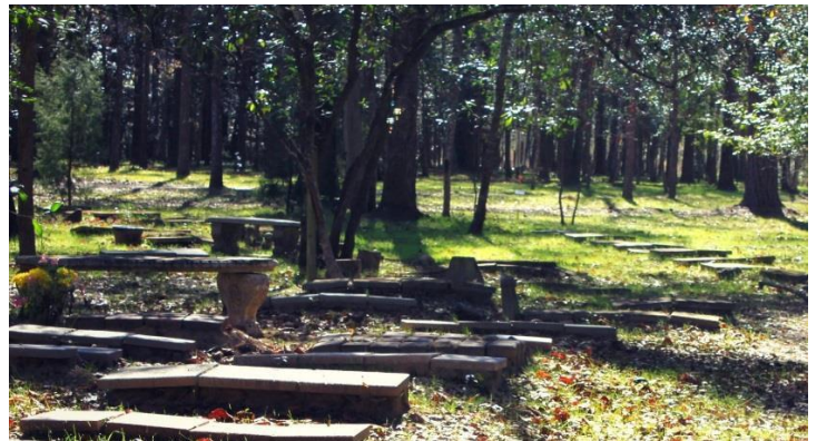
Hallie Hill Cemetery

Near this spot are deposited the remains of one who possessed beauty without vanity, strength without insolence, courage without ferocity and all the virtues of man without his vices.- Lord Byron