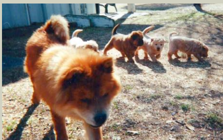
Miss Kitty and her pups then 2001 -their first summer at Hallie Hill!

Miss Kitty was found wandering the road just across from Hallie Hill in December of 2000. It was obvious she was abandoned and had just delivered a litter of puppies. After an extensive search of the woods, her litter of seven was found in a den Ms. Kitty formed at the base of a fallen tree. Miss Kitty was covered in matted fur and parasites. She was very thin and working hard to find enough food to survive and nurse her puppies. Over the years this family has enjoyed a good life at Hallie Hill. Miss Kitty is one of our many senior citizens at about 16 years old. She now suffers from arthritis but otherwise is in good health. She enjoys an air conditioned room in the back of the bunkhouse, soft bedding, and special treats.