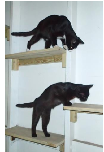
Jack (above) and Jill (below) search the shelves for a tasty treat.

One of the favorite tasks of the caregivers at Hallie Hill is the daily distribution of treats. Every afternoon a staff member walks around giving out treats as they complete a physical inspection of each animal and clean out the water bowls in the enclosures. Usually the snack is a simple biscuit, but sometimes the animals are surprised by something different. For example, the dogs often enjoy a frozen treat during the hot summer months. The cats of Hallie Hill also appreciate a daily treat. The cats have fun searching the enclosure for treats the staff hid for them.