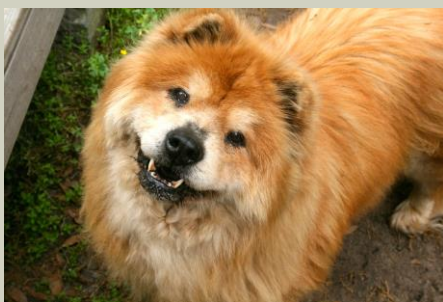
This beautiful Chow Chow was named for the strong, independent, red-haired saloon owner in the television series "Gunsmoke".