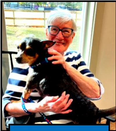
Rambo thanks the Westfall Family